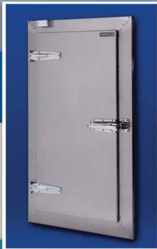
Standard Commercial Marine